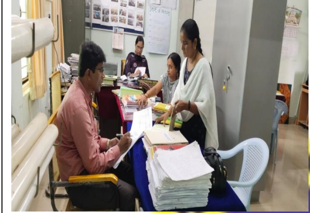
Dept of Journalism