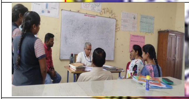
Depts of Botany and Microbiology