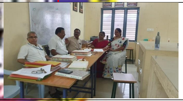
Dept of Zoology and Paramedical Technology