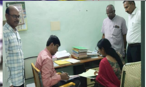
Dept of Hindi