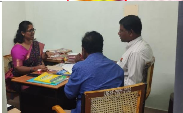
Dept of Computer Science