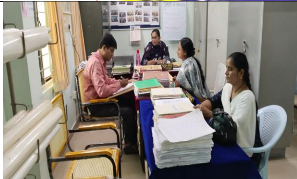
Dept of History