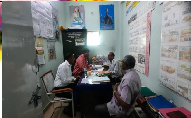
Depts of Telugu and Sanskrit