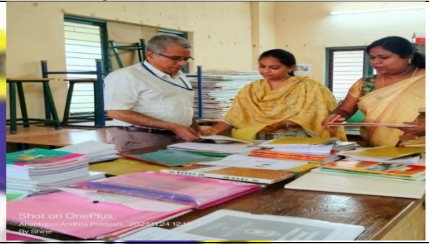
Dept of Electronics