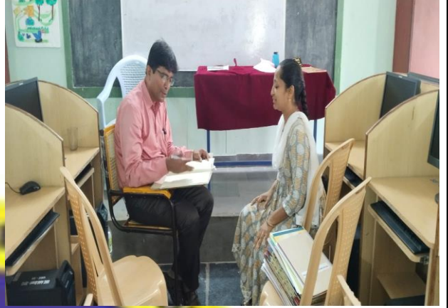
Dept of Computer Applications