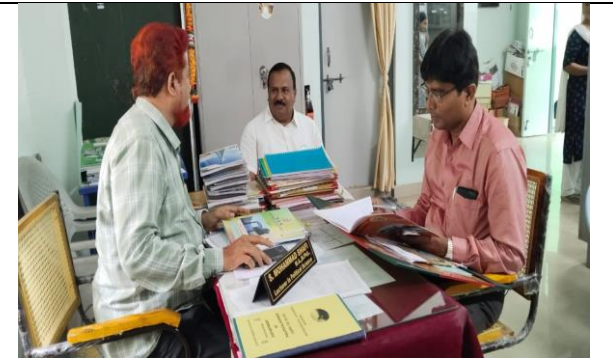
Dept of Political Science