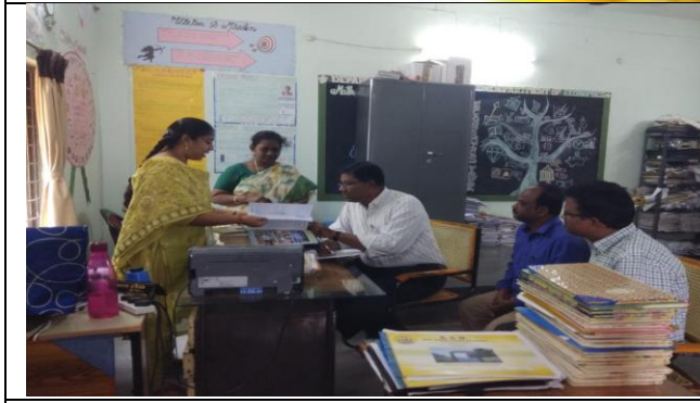
Dept of Mathematics