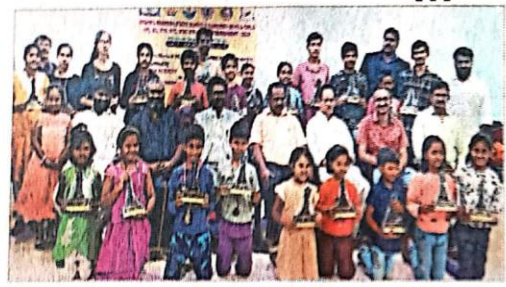
పతకాలు అందుకున్న వివిధ జిల్లాల క్రీడాకారులు