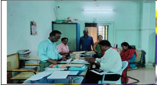
Dept of Commerce